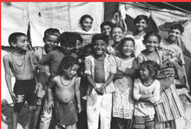
First day picture when we met these kids.

On September 3, 2020, we started with 14 homeless kids, they were given 15 days classes on road side tents where they lived with their families. After 15 days we moved them to the school place. Within a month they had their own separate classroom and the results of our little efforts were amazing. These kids started showing exceptional skills with just weeks of training.