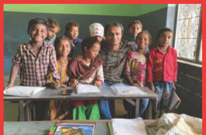
Happiness is seeing the smile on a child's face as they learn.