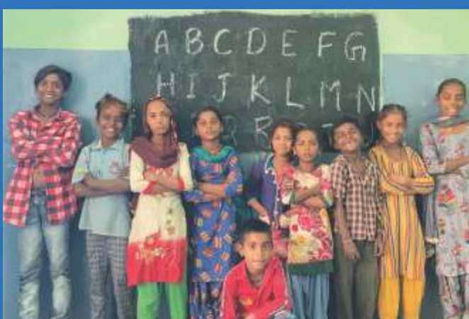
Picture taken after 15 days when we shifted them to a classroom.