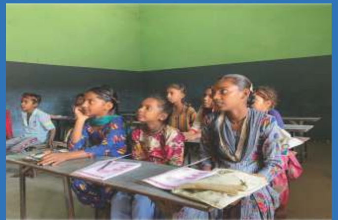
The kids were focused and attentive during first class at the new classroom.